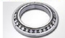
Crossed Roller Bearings