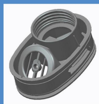
Parametric CAD Model