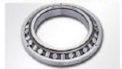
Crossed Roller Bearings